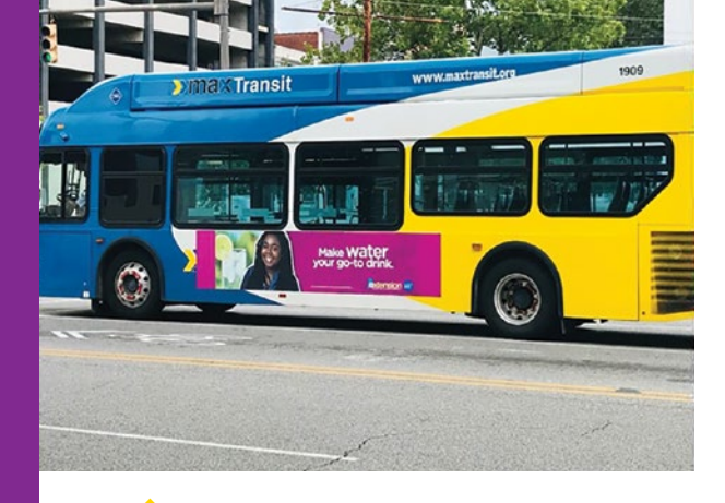
Alabama A&M's SNAP-Ed social marketing campaign through public transportation.

Alabama A&M partners with Auburn University to carry out a broad SNAP-Ed social marketing and advertising campaign that includes billboards and public transit signage. Billboards are placed in urban counties with over 11 million views, while bus signage is visible to 1 million riders.